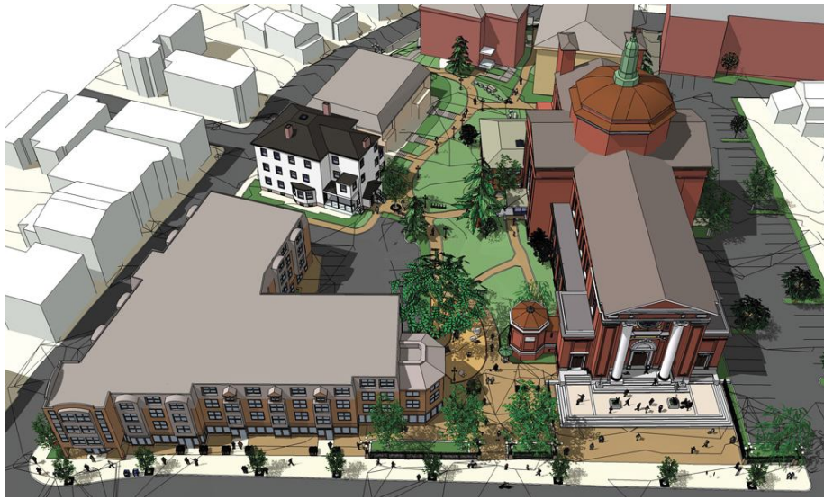
Bird's-eye view of green campus.

Project Information: The sale of this three and one-half acre Archdiocese site in 2005 with its historically significant cathedral, convent, rectory and two schools elicited strong interest from community groups, because the Cathedral and its campus had played a central role in the lives of many residents. Suggestions brought forth at community meetings provided insights into the past use of the site, current neighborhood needs and helped to guide the programming to a positive outcome.