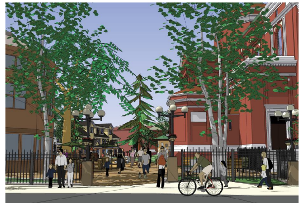
Entrance into the plaza from Centre St.

The goals of the landscape design were to support building uses with complementary landscape spaces, incorporate existing historic features, such as the unique iron fencing and stone pillars, into the new landscape and to welcome neighborhood residents into the site. A small plaza along Centre street can provide outdoor seating for a proposed restaurant or small gatherings, and the open green invites families to relax outdoors, The open green is planted with native informal plantings which present a refuge for humans and wildlife alike. The green is transversed by an accessible path which follows past desire lines supporting a pedestrian link between the neighborhood.